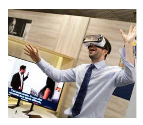
TechHub exhibit: Exhibition zone dedicated to PropTech